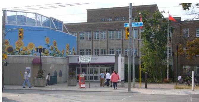
Above: CAMH's existing Administration Building, the Workman Theatre is at left.

Please visit our website at www.camh.net